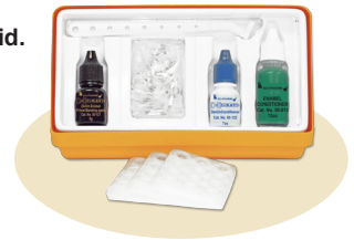
Cat. No. 50-120